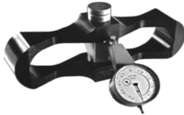
Fig. 1. Mechanical dynamometer

The action of the hydraulic dynamometer is based on the displacement of the fluid from the cylinder by the measured force. Under pressure, the liquid flows through a pipe to the recording device and is recorded. The disadvantage of hydraulic dynamometers is their lack of sensitivity at low forces (less than 100 kg), as well as a tendency to vibrations. Due to their bulkiness and high inertia, hydraulic dynamometers are rarely used; they are unsuitable for investigating the instantaneous values of forces.