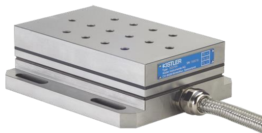
Fig. 2. External view of three-component dynamometer using the piezoelectric principle of force measurement

To measure cutting forces, inductive devices are also used [13]. The disadvantage of such devices is the ability to measure only static loads. There are also induction devices for cutting forces that allow measuring forces in dynamics, but this type of device does not allow measuring large forces and has a small measurement range.