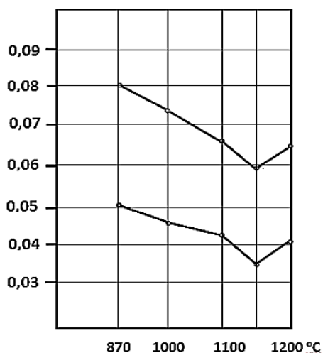
Previous quenching temperatures °C

Recently, an increase in the elastic limit and relaxation resistance has been established. The obtained effects previously determined the application areas of the developed technologies of heat treatment with double phase recrystallization.