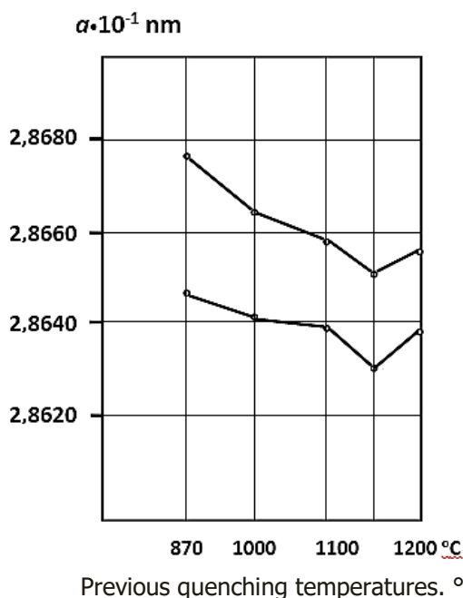
Fig. 2. Change in the grating period of steel U8A depending on the temperature of Previous quenching and intermediate tempering

These modes include the first recrystallization with heating to extreme temperatures, which are within 1100-1150 ° C for carbon and low-alloy steels. At these heating temperatures, not only the dissolving of the carbide phase occurs, but dissociation and the beginning of dissolving of the refractory phases is observed [10].