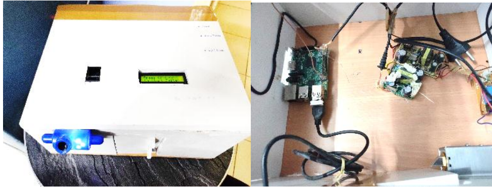
Fig.4: Developed Hardware

The developed hardware is presented in the figure above for implementation of smart security system. The system captures the face image and if it matches with the saved image the door opens. Any person whose face image was not saved on the system will get entry in the house only after it is allowed by the authorised person upon verification of the person by means of video.