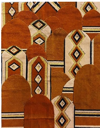
Sample (1) Work dimensions: (50 x 40) cm