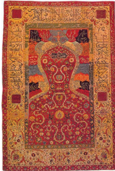
Figure (1) Iranian Prayer Rug (Tabriz)

One of the established patterns in weaving modern prayer rugs is the mihrab, which serves as a symbol confirming that the rug is dedicated solely to prayer. The columns supporting the mihrab vary, ranging from stepped columns to two straight columns. A niche (mishkat) may hang above it. (Mohamed Kamal, pharmacist, 1988)