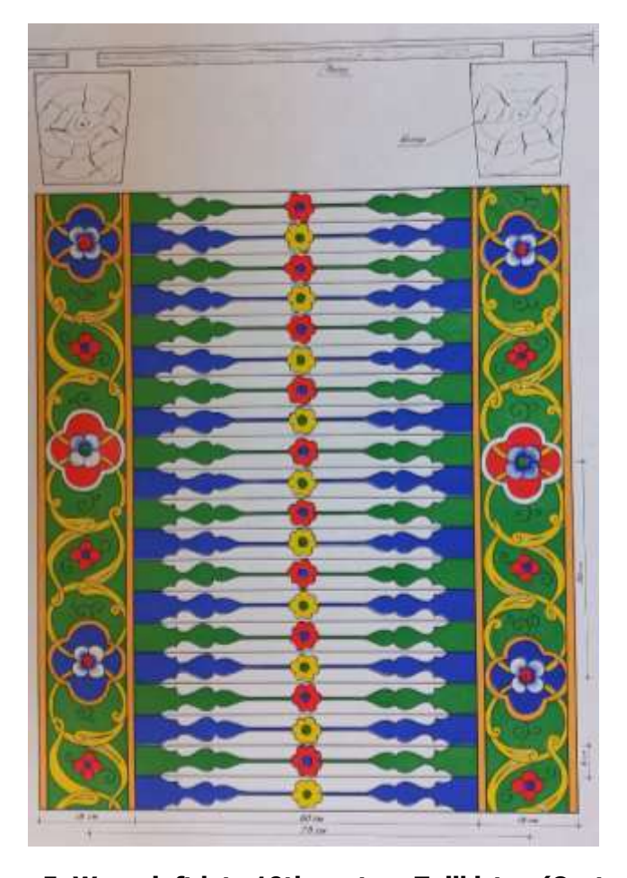
Figure 5. Wassajuft late 19th century Tajikistan (Oratepa).

People with high artistic thinking had great importance in raising children in an environment of beauty. Through science, man has come to understand himself and his creation and the universe.