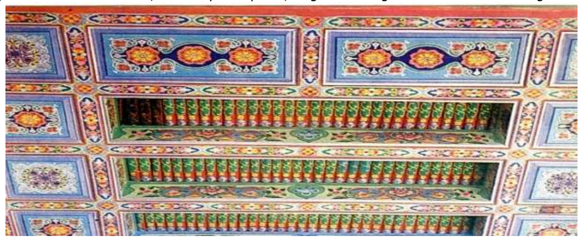
Figure 2. Namangan. Khoja Amin Mosque.

The development of exact sciences in the 9th-12th centuries also affected the field of architecture and raised the symbolism in patterns to a higher level. A number of scientific studies have been done on architectural decorations. However, there are some ambiguities regarding them. After all, they have not only constructive (practical) and decorative functions, but also philosophical, religious-ideological and semantic meaning.