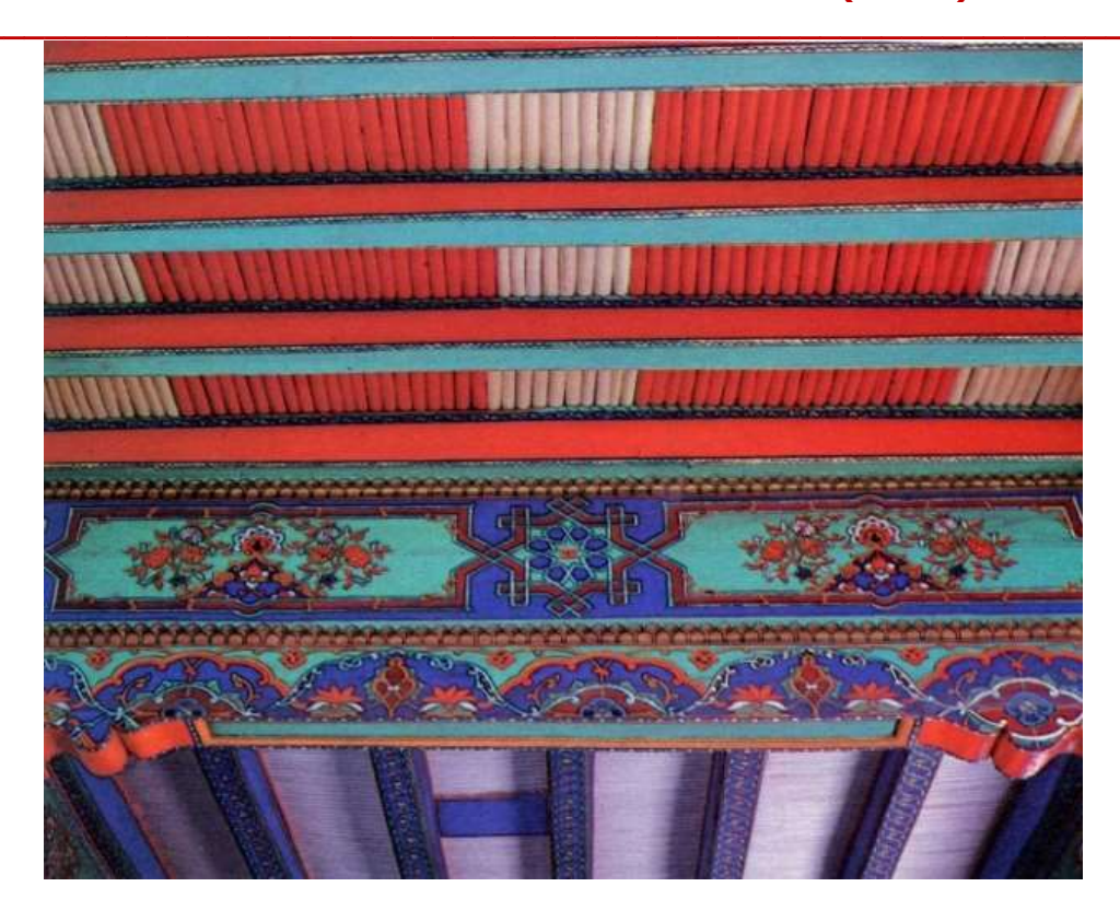
Figure 3. Lutfullo Maulana Mosque. Part of the pattern on the bolars. Quiet. The beginning of the 20th century [4].

It is interesting that in the worship of one of the Hittite deities, the rituals dedicated to the Sun Goddess were performed on the roof of the temple. From the roof of a temple or a palace, he addresses the sun god of the sky with his prayers, and the Hittite king Muwatalli addresses the sun god, the mistress of his city Arinina. In other autograph monuments, it is written that "The king worships and descends from the roof to the inner holy (sacral) room" [5].