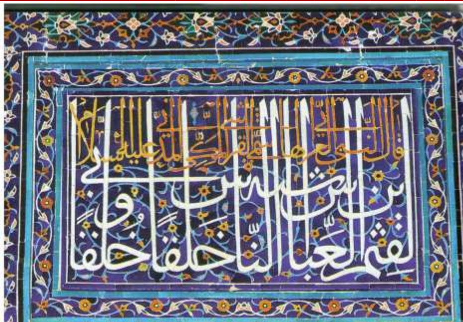
Fig. 1. Inscription at the entrance of Qusam ibn Abbas mausoleum. The Prophet, peace be upon him, from the Arab Hashemite dynasty, from the Quraysh tribe, from Mecca and Medina, said: "Qusam Ibn Abbas is the most similar to me in terms of structure and behavior".

Three famous rulers in history - Amir Temur, Ulug'bek Mirzo and Amir Yalangtosh Bahadir - built Samarkand with their architectural monuments and turned Samarkand into "the beauty of the earth". Amir Temur turned Samarkand into a capital city and began to build a series of decorative buildings, while Registan square, which is considered the heart of the city, was created during the reign of Ulugbek Mirza. (At that time, this area was called "Sardavonak", roughly meaning "Sari joyi davonak" - "head of a fast-flowing stream"). Ulug'bek creates a unique bouquet of monuments on this square, consisting of three buildings, such as a madrasa, a house and a caravanserai. [5]