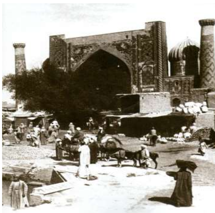
Figure 2. Sherdar madrasa. Early 20th century.

In his time, Yalangtosh Bahadir also built Sherdor and Tillakori madrasas on the site of the ruined house and caravanserai without destroying the structure of this building complex built by Ulugbek. In due course, I should also say that the gold spent inside the mosque of the Tillokor madrasa could be used to build a large monument (that's why the madrasa was called Tillakori, that is, "Made of gold").[6].