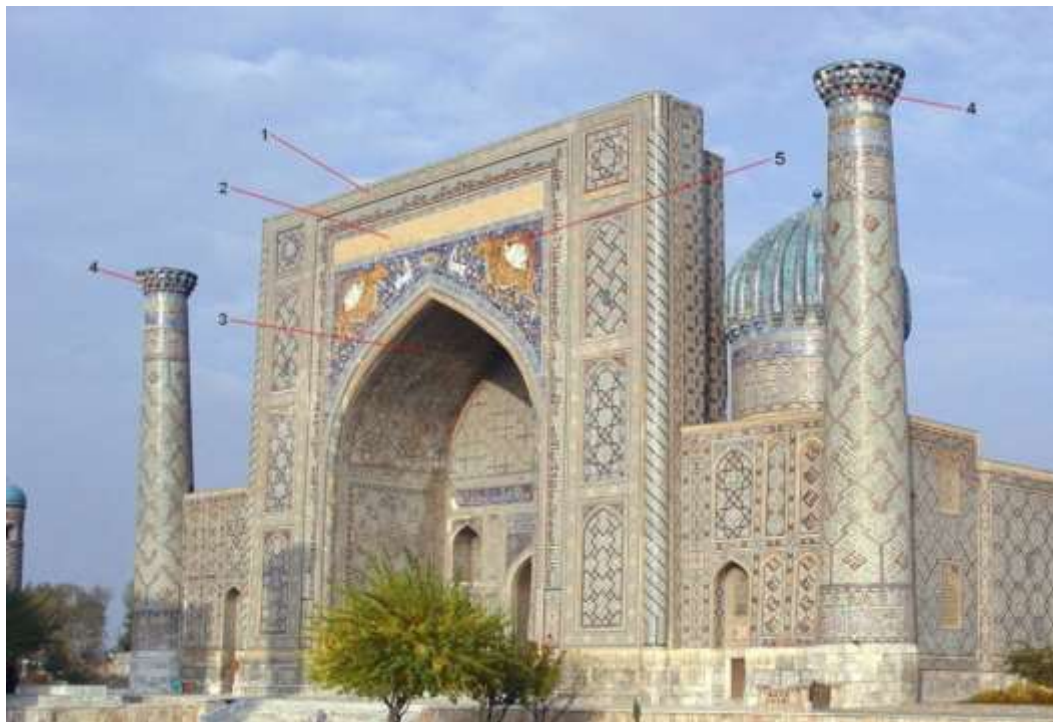
Figure 3. Naming of parts of Sherdar Madrasa. 1. Peshtok 2. Kitaba 3. Ravok 4. Bouquet 5. Kanos

Yalangtoshbi Bahadir, who built the Sherdar and Tillakori madrasas, was able to build more magnificent monuments. We are mentioning this word because of the opinion of some foreign and local monument experts that the masters of his time were not able to create monuments of a different color by taking only a copy from the monuments of Yalangtosh Bahadir Ulugbek Mirzo. However, the Sherdar and Tillakori madrasas are among the most beautiful monuments adorning the city of Samarkand. Yalangtoshbi Bahadir, who did not consider his "Olchin" clan inferior to the "Barlos" clan of the Timurids, humbly copied the structure of the Ulugbek madrasa in his monuments out of respect for the Timurids (pictures 2, 3). In other words, he wanted to build a bouquet of various monuments on Registan Square [14].