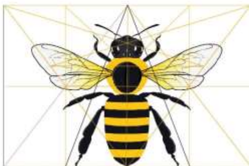
Figure 5. Analysis by Allok that bees were created based on the golden ratio.

"Then eat of various fruits and walk in the paths that your Lord has made easy (for you)! From their bellies let out juice (honey) of different colors, which is healing for people. Indeed, there is a sign in this for a thinking people" [1].