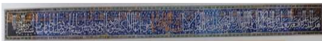
Figure 4. Sherdar Madrasa. Peshtokda Bakhshi inscription. Epigraphic description of Surah "Nahl" in the Holy Qur'an.

In life, a person is amazed when he logically realizes that the world has become more beautiful with such intelligent people living around us. In fact, the universe and all things in the universe are perfectly created and assigned tasks to be performed by Allah. What would happen if there were no mountains, flies, bees, etc. on the earth? For example, world scientists have proven that there will be no life if there are no bees in the world for 10 years. We found the answer to the above question in the verses of the Holy Qur'an, Surah Nahl. Surah Nahl [12] of our holy book "Holy Qur'an" consists of 128 verses, and in its verses 68 and 69 it is said about bees: