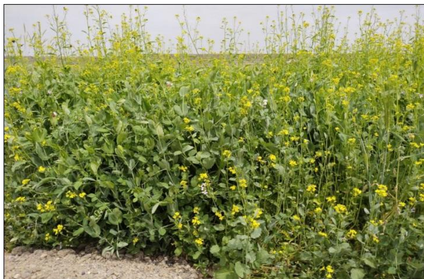
2nd image. Pea + Rape.