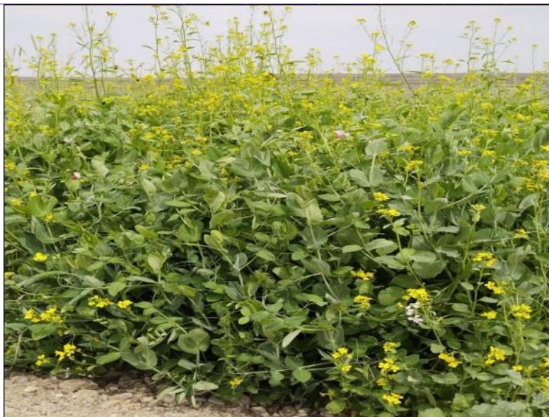
3nd image. Peas + Grey Mustard.