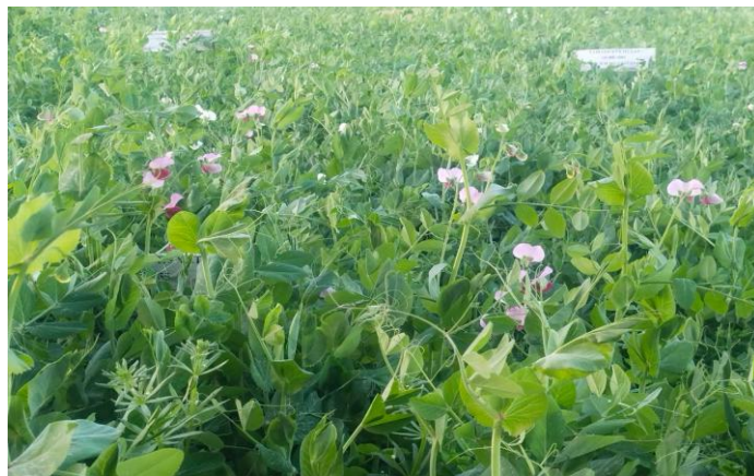
1-rasm. Peas (Green Peas).

The oilseed turnip plant, after sowing the seeds, germinated in 3–6 days with field germination rates of 87.1–93.6%, the budding phase lasted 10–13 days, flowering lasted 17–20 days, pod formation and seed maturation took 35–37 days, and the ripening and full ripening phase lasted 8–16 days. In the flowering and ripening phases of the oilseed turnip, the plant height was 141.1–145.2 cm, the stem thickness per m 2 was 58.0–58.3, the number of stems was 1, the number of side branches was 8–10, the pod length was 8.2–9.0 cm, the number of seeds per pod was 7.0–8.0, and the weight of 1000 seeds was 9.7–12.3 grams. The seed yield was 22.0–23.5 centners/ha.