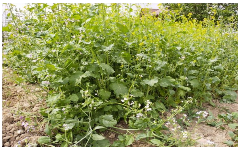
4nd image. Oilseed Radish; Grey Mustard; Rapeseed.